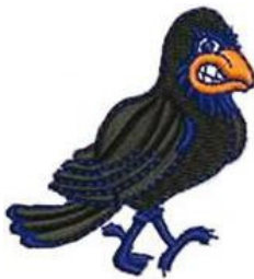
One Day A