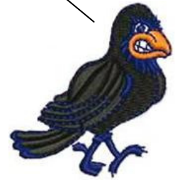
One Day D