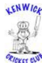
Kenwick's One Day D Statistics